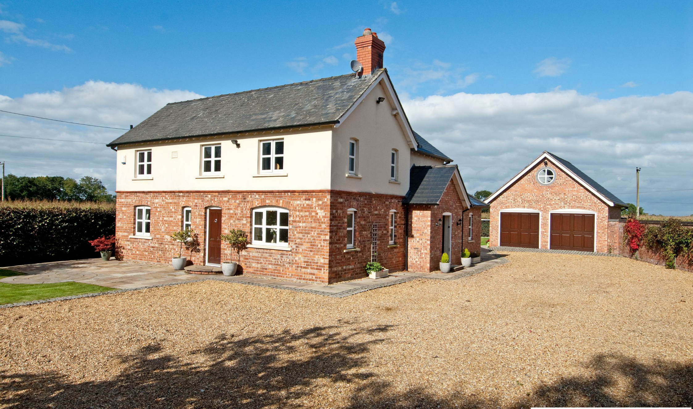
Holmshaw Farmhouse CW1 5XF Guide Price £950,000